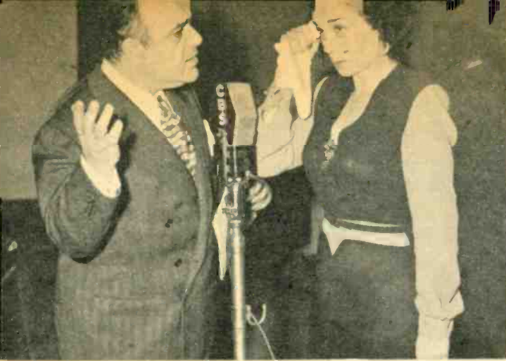
▲ AKIM TAMIROFF , brilliant star of "For Whom the Bell Tolls", and Bea Benedaret , prominent radio actress, played the role of refugees in Ludwig Bemelman's "Now I Lay Me Down to Sleep". Stars are chosen not only for their name value, but also for their suitability for their parts.