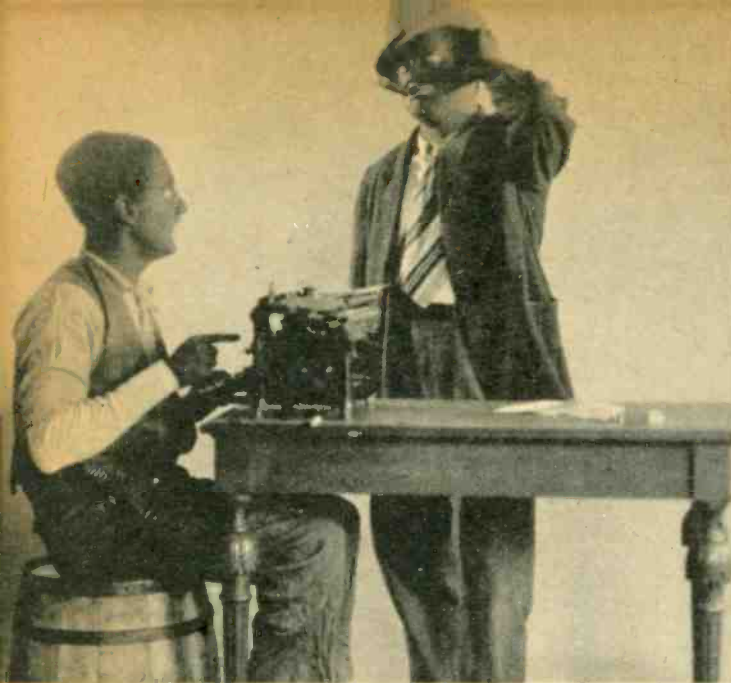
▲ FIRST BLACKFACE PICTURE ever made of Gosden and Correll (1926) shows the former as "Sam", left, and Correll as "Henry". Sam and Henry were forerunners of Amos 'n' Andy.