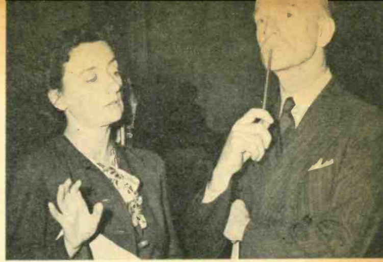
▲ ON SAME BROADCAST WERE Mildred Natwick and Ian Wolfe, pictured in emoting scene from Bemelman's story. Enacted are the choices of top writers, but occasionally, second choices have to be made because (like Sinclair Lewis' "Babbitt" excerpt) dramatization on thirty-minute airshow is impossible.