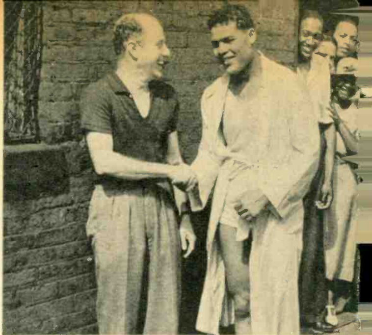
▲ TEN YEARS LATER , Freeman Gosden, established as the famous Amos, shakes hands with Joe Louis when the champion was in Chicago.